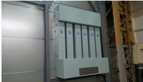
A suite of very high current (VHC) power line filters of various current ratings, including custom 2500V DC 2000A units complete with end enclosures, have been integrated into a major UK test chamber installation. Those MPE DC filter units, pictured here in situ, measure 3m high by 2m wide and weigh two tonnes.