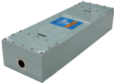
High-voltage MPE power line filter