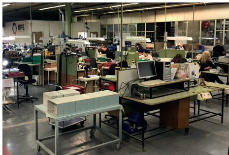
Large HEMP filters in production and assembly