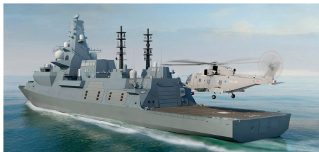
Low-leakage TEMPEST filter solutions from MPE are integral to the design of the new Royal Navy Type 26 frigate