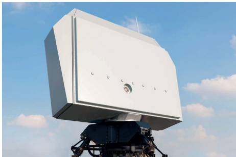
The Thales NS100 4D naval, air and surface surveillance radar