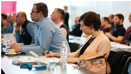
Participating in an EMV workshop