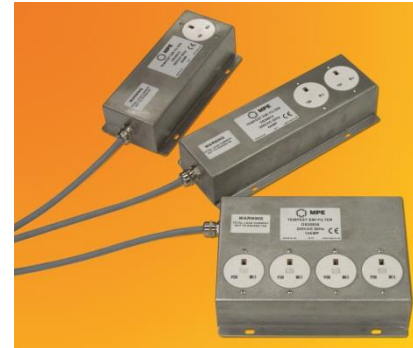
TEMPEST Pluggable Range