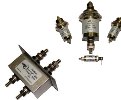
Typical Feedthrough Products