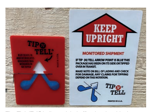
The Tip'n'Tell® indicator label affixed to the shipping crate prior to despatch from MPE gives clear evidence of any mishandling en route.