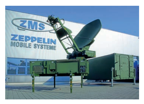
Display of mobile custom-made shelters outside the Zeppelin Mobile Systeme headquarters at Meckenbeuren