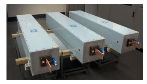
A consignment of Mil-Std-188-125 MPE HEMP filters prior to shipment