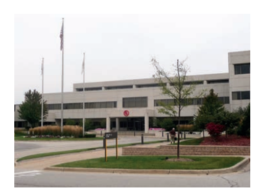
The world headquarters in Northbrook, Illinois, of the global safety science company UL