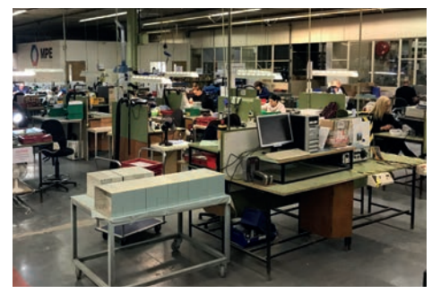
Large HEMP filters in production and assembly