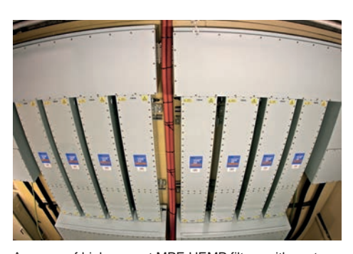
An array of high-current MPE HEMP filters with custom mountings incorporated into the RAF Fylingdales ballistic missile early warning system (BMEWS) in North Yorkshire