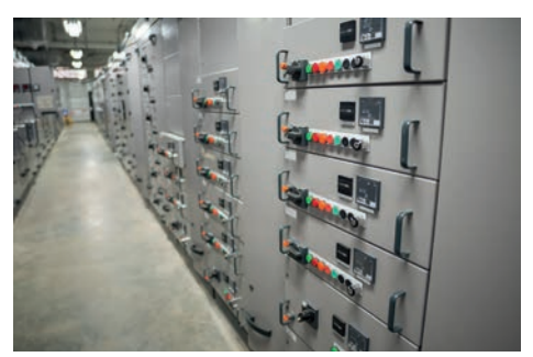
MPE's HEMP protection filters are installed in a US Navy power plant on East Coast USA.