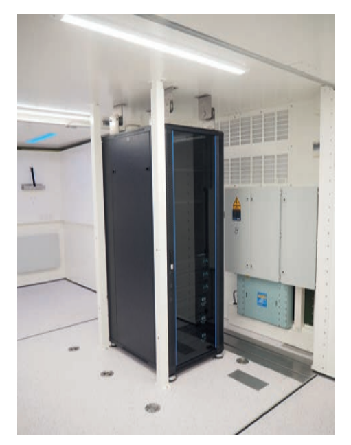
Mobile datacentre with 32A MPE power line EMC filter installed