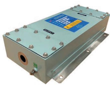
An MPE low-leakage TEMPEST power line filter for naval applications