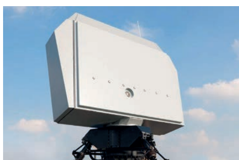
The Thales NS100 4D naval, air and surface surveillance radar