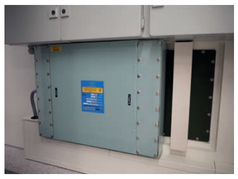
Close-up of the 32A MPE high-performance power line EMC filter in situ