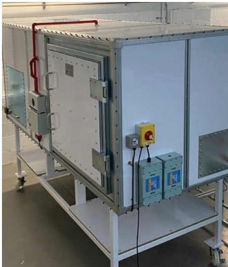
The three bespoke EMC test chambers installed at Isotropic Systems in Reading