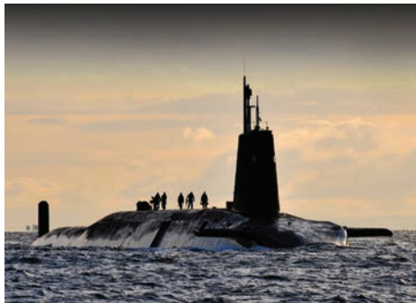
Vanguard Class submarine at sea, as in the new BBC TV drama 'Vigil'