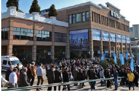
TÜYAP Fair Convention and Congress Centre in Istanbul