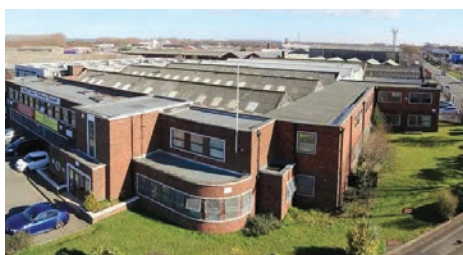
The North West Training Council (NWT) Engineering Training Centre