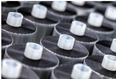
Capacitor manufacture at MPE