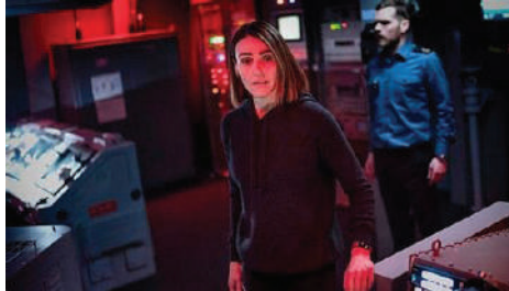
A scene from the BBC drama, set in HMS Vigil's control room