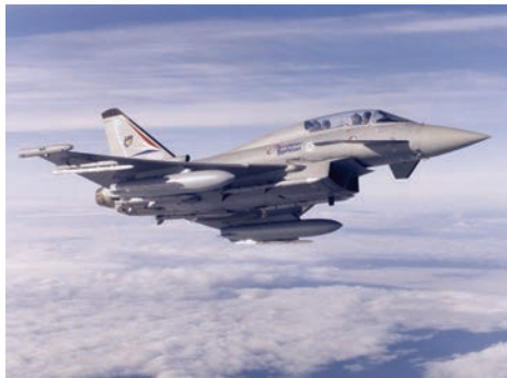
In a defence aviation project, MPE supplied custom ceramic capacitors to Italy for the control of the chaff and flare countermeasures within the Eurofighter Typhoon platform