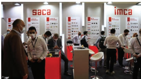
At the International Defence Industry Fair (IDEF)