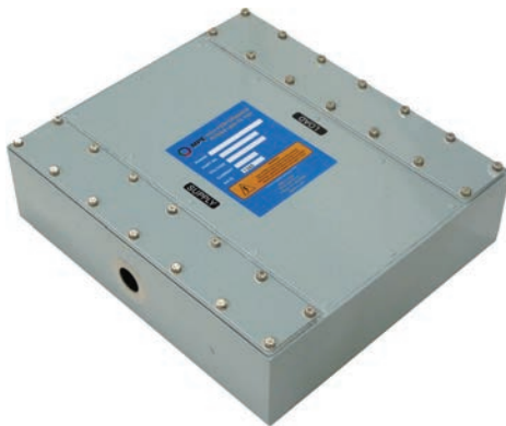
A typical high-performance, ultra-low-leakage power line filter designed and manufactured by MPE