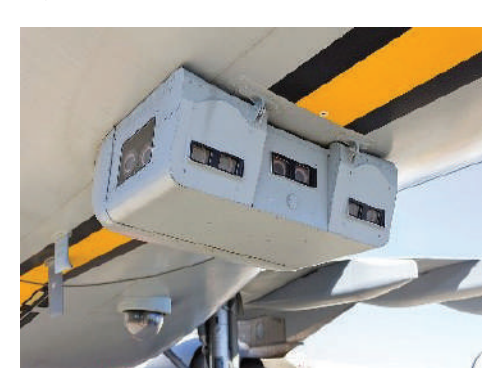
A Kappa Enhanced Vision System camera as mounted on the A330 refuelling tanker for in-flight surveillance