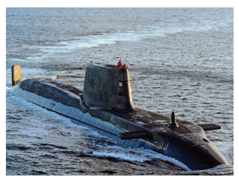
Astute Class submarine