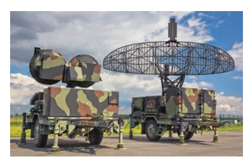
Example of a mobile radar installation in the USA