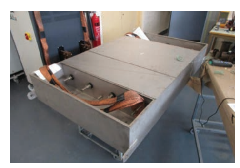
MPE filter during current overload testing at MPE, Liverpool