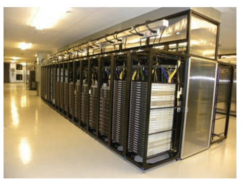
Data centre application typical globally