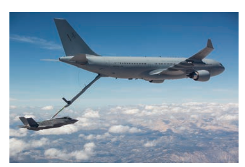
Air-to-air refuelling by an Airbus A330 tanker of the Royal Australian Air Force (RAAF)