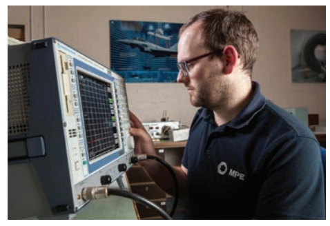
Testing filter performance at MPE