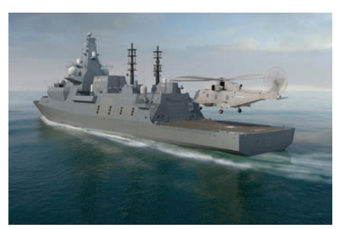
The new Royal Navy Type 26 frigate