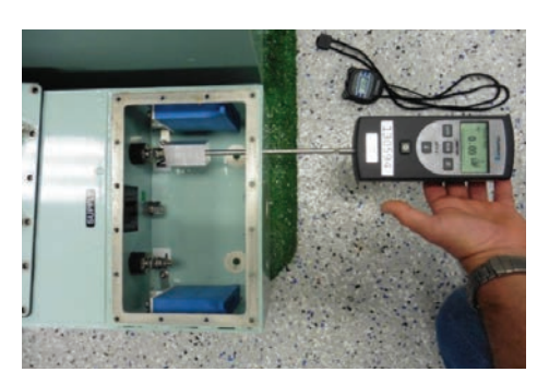
Terminal pull test set-up at Intertek, Michigan