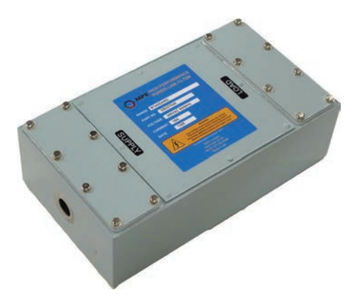
16A TEMPEST power line filter manufactured by MPE for the Royal Navy