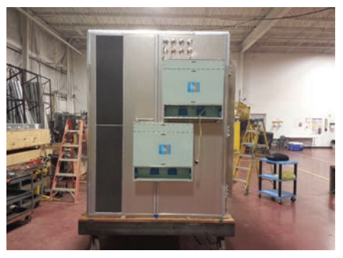
MPE filters mounted to shield for shield effectiveness testing at DeTech, Virginia

As per the requirements of USACE and UFGS, thermal shock testing was also conducted. The MPE filters were subjected to ten cycles of testing at four different temperatures ranging from -55°C and +85°C, with filters being exposed to each temperature for at least eight hours. Following this extensive testing, the filters were again electrically tested and found to be compliant with the stipulations of USACE and UFGS.