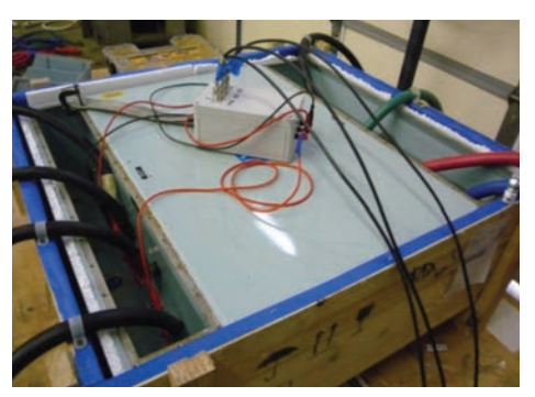
MPE filter during harmonic distortion testing at DeTech, Virginia