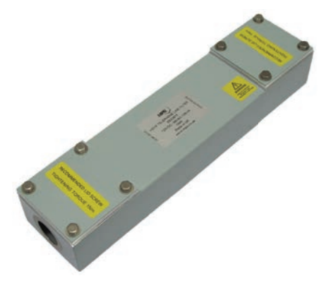
A typical MPE dataline filter