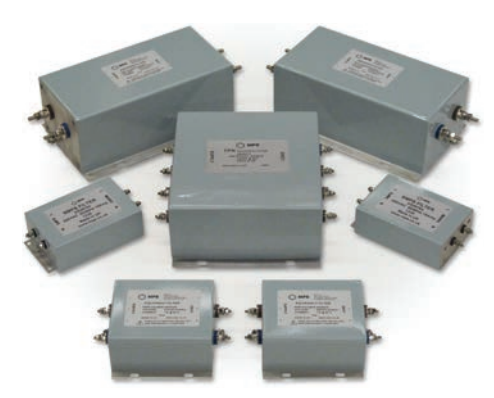
A range of MPE equipment filters