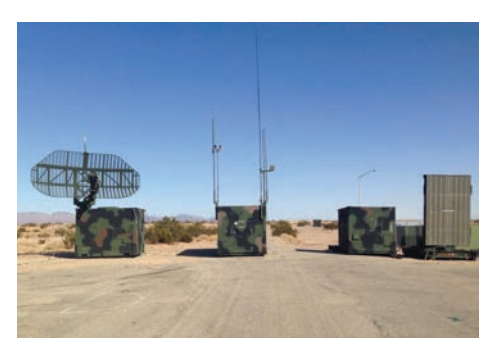
Tactical shelter application such as in other countries