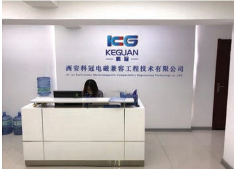
The reception area of Xi'An Tech Crown