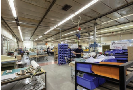
The expansive assembly floor at MPE