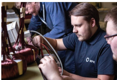
MPE's manufacturing team has increased by 27%